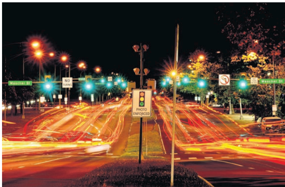
This long exposure photo shows traffic driving on Roosevelt Boulevard in Philadelphia, Wednesday, May 25, 2022.